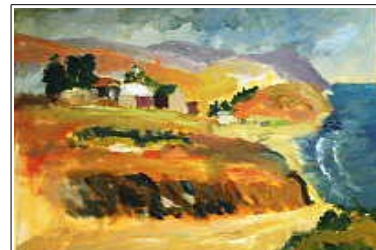
Model for demo