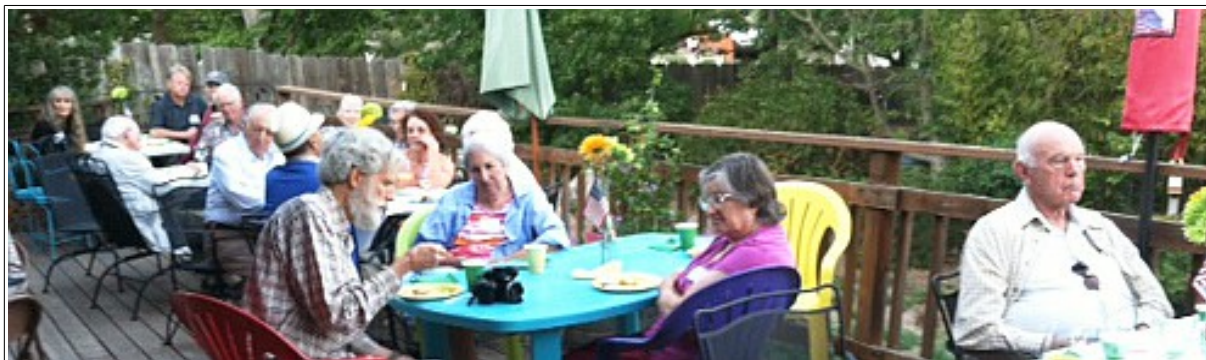
Serious Business .. Eating