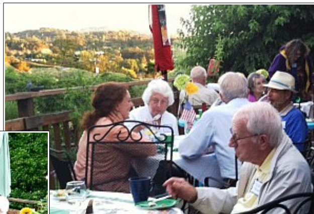
Good Company Good Food Gorgeous View