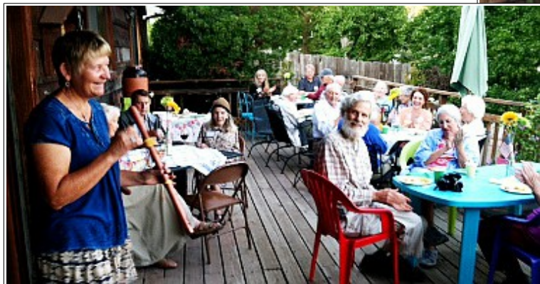
Our Multi-talented Hostess